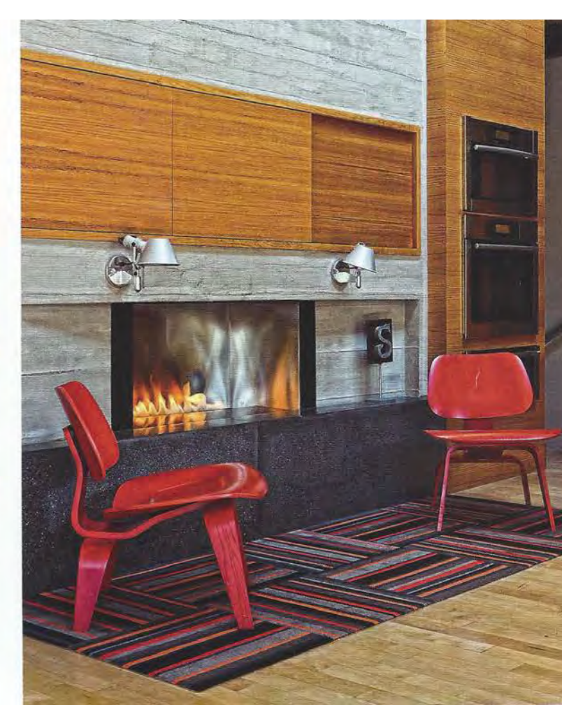
Left: Concrete and stainless steel surfaces are warmed by the custom-made Douglas fir cabinetry in the kitchen. Above: Two Eames chairs front the kitchen fireplace.

describes the feel they wanted. "We were both influenced by Seattle and the Pacific Northwest. We love the honey color of Douglas fir and mixing materials like steel, concrete and plaster with warm natural wood and stone."