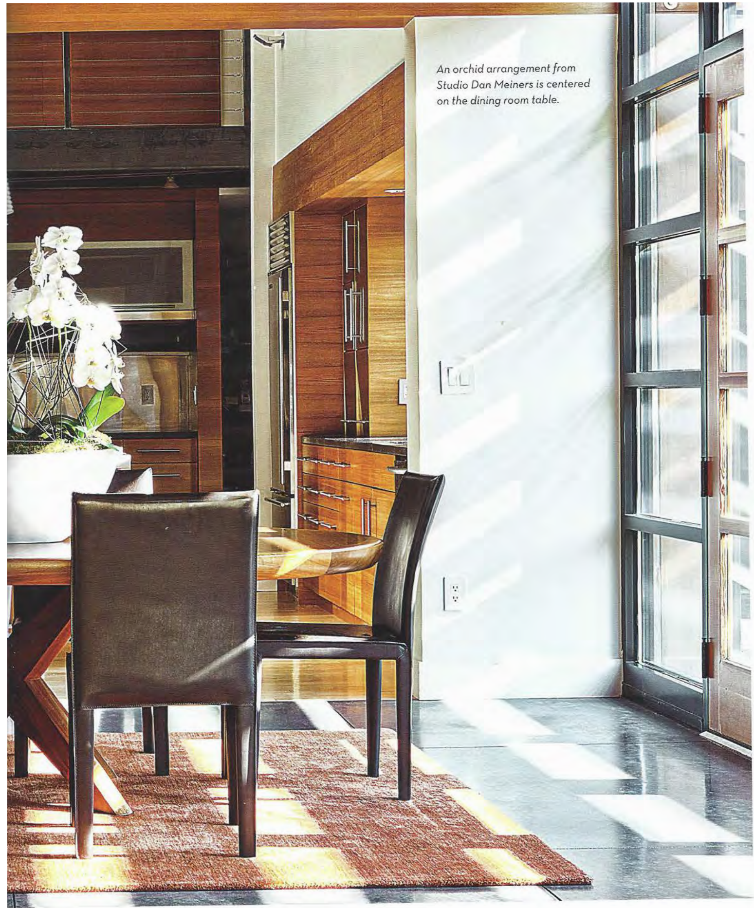
An orchid arrangement from Studio Dan Meiners is centered on the dining room table.