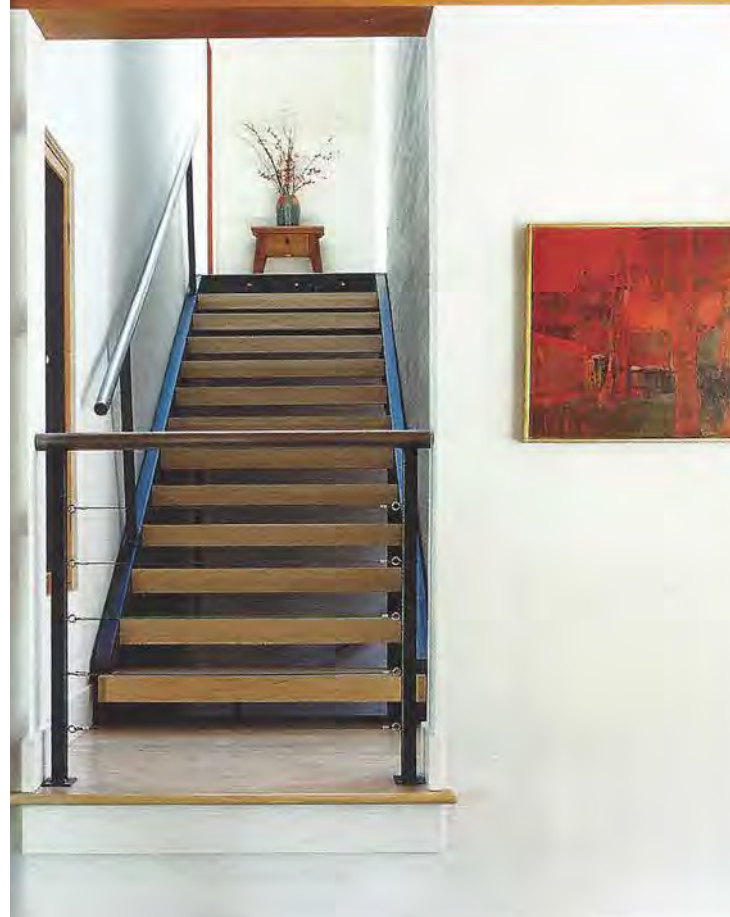
Opposite: In the living room, the beamed ceiling matches the wood used for the fireplace wall and the built-in console. Above: Broad steps lead from the dining room French doors to the outdoor living space. Left: The open staircase leads to the second floor and the sons' rooms, guest room and balcony over the kitchen.

shared with their two sons, a corner lot in Mission Hills beckoned.