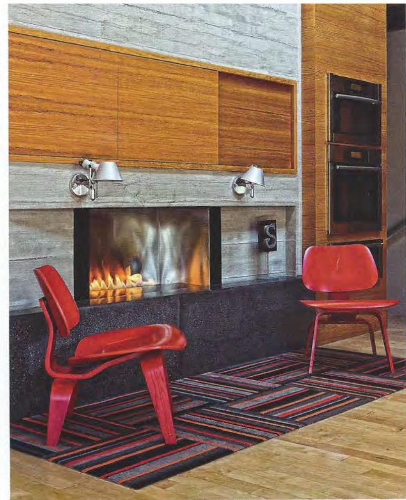
Left: Concrete and stainless steel surfaces are warmed by the custom-made Douglas fir cabinetry in the kitchen. Above: Two Eames chairs front the kitchen fireplace.

describes the feel they wanted. "We were both influenced by Seattle and the Pacific Northwest. We love the honey color of Douglas fir and mixing materials like steel, concrete and plaster with warm natural wood and stone."