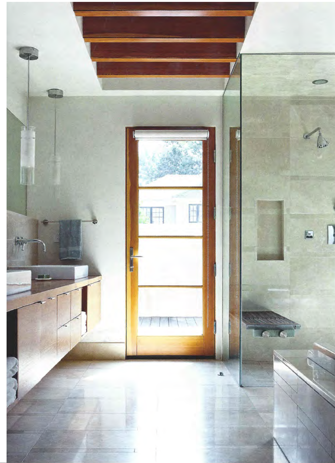
Opposite: French doors at the foot of the bed in the master bedroom lead directly to the courtyard. Left: The master bathroom is a wealth of detail: the inset beams, the creatively patterned tile, the built-in bench in the shower.

And to get the house to perform as they wanted—lots of windows but soundproof, sturdy and solid yet refined—they often turned to commercial products and fabricators such as Loewen Windows, Carter Glass, and Umicore/VM Zinc. “The aluminum storefront windows in the entry and dining have worked very well and allow large amounts of insulated glass,” says Brad. “The natural zinc roof is more common in Europe on residential projects.”