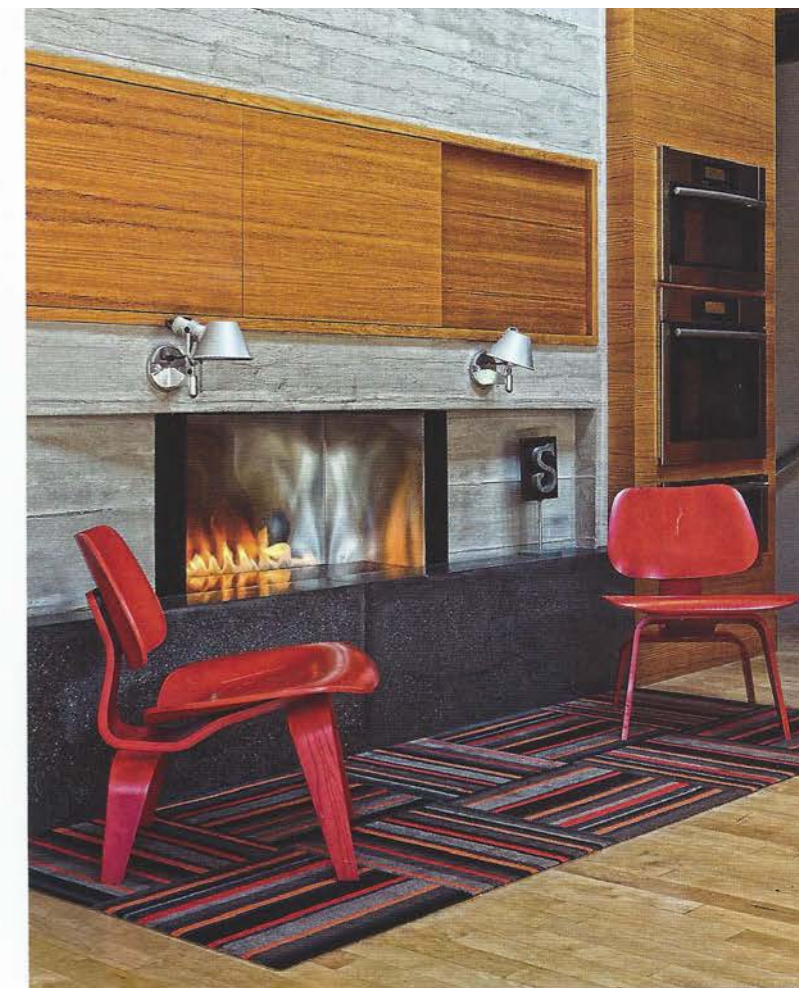
Left: Concrete and stainless steel surfaces are warmed by the custom-made Douglas fir cabinetry in the kitchen. Above: Two Eames chairs front the kitchen fireplace.

describes the feel they wanted. "We were both influenced by Seattle and the Pacific Northwest. We love the honey color of Douglas fir and mixing materials like steel, concrete and plaster with warm natural wood and stone."