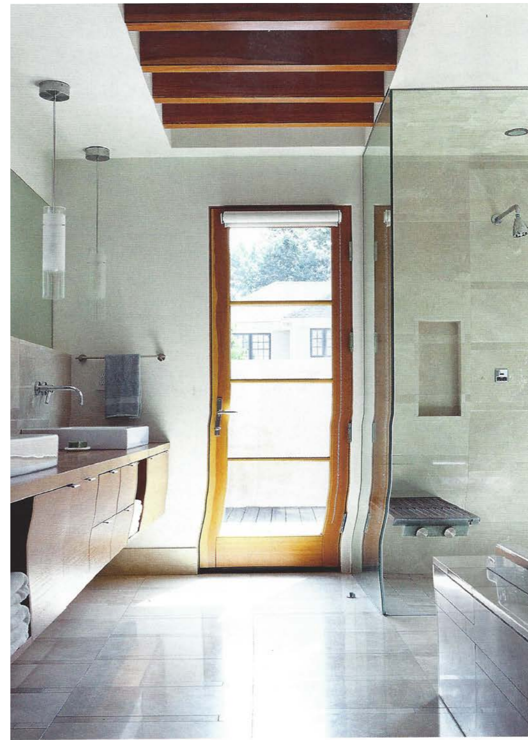
Opposite: French doors at the foot of the bed in the master bedroom lead directly to the courtyard. Left: The master bathroom is a wealth of detail: the inset beams, the creatively patterned tile, the built-in bench in the shower.

And to get the house to perform as they wanted—lots of windows but soundproof, sturdy and solid yet refined—they often turned to commercial products and fabricators such as Loewen Windows, Carter Glass, and Umicore/VM Zinc. “The aluminum storefront windows in the entry and dining have worked very well and allow large amounts of insulated glass,” says Brad. “The natural zinc roof is more common in Europe on residential projects.”