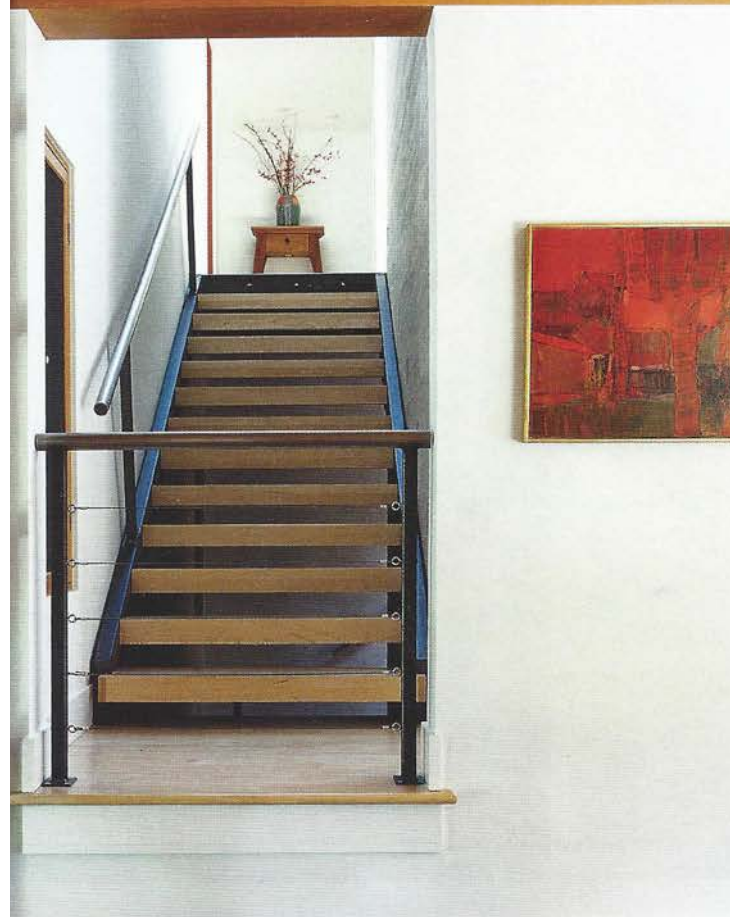
Opposite: In the living room, the beamed ceiling matches the wood used for the fireplace wall and the built-in console. Above: Broad steps lead from the dining room French doors to the outdoor living space. Left: The open staircase leads to the second floor and the sons' rooms, guest room and balcony over the kitchen.

shared with their two sons, a corner lot in Mission Hills beckoned.